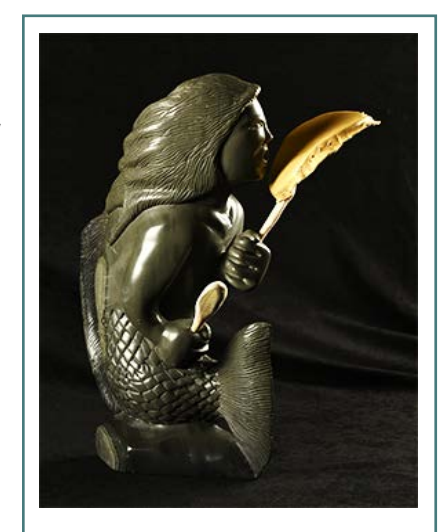
Presented to Recreation North from the Arctic Inspiration Prize